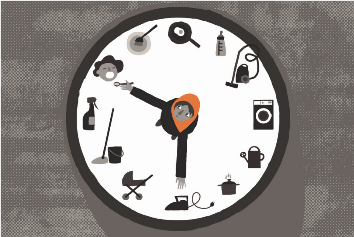
Excessive working hours

Oman is also reportedly considering revisions to its labor law. In May 2015, the Times of Oman quoted a Ministry of Manpower official stating that Oman is considering extending the law's protections to include domestic workers. At present, Oman's labor law explicitly excludes domestic workers from important protections enjoyed by workers in other sectors, such as limits on working hours and provisions for overtime pay. Instead, domestic workers only enjoy a much narrower range of basic protections under regulations issued in 2004 that specifically pertain to domestic workers.