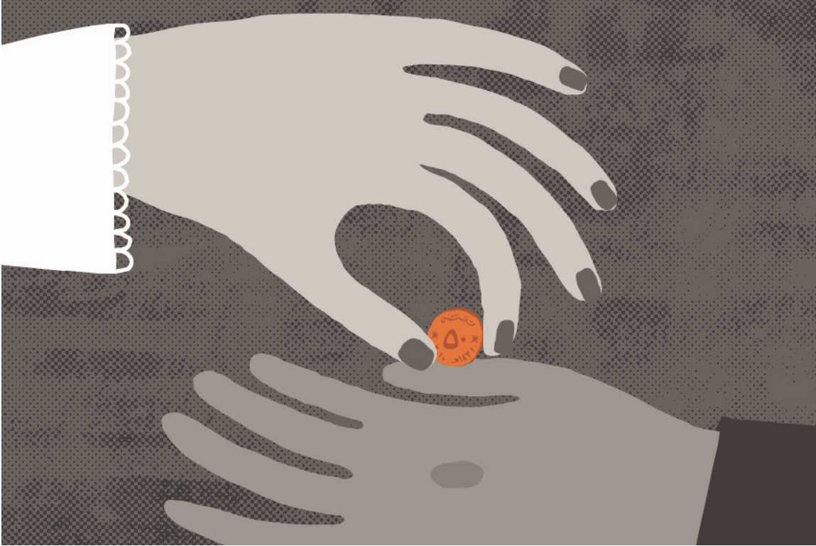
Not paid full salaries or at all

Omani law does not provide, such as minimum salaries. But they can do little to enforce these protections once their nationals are in the country.