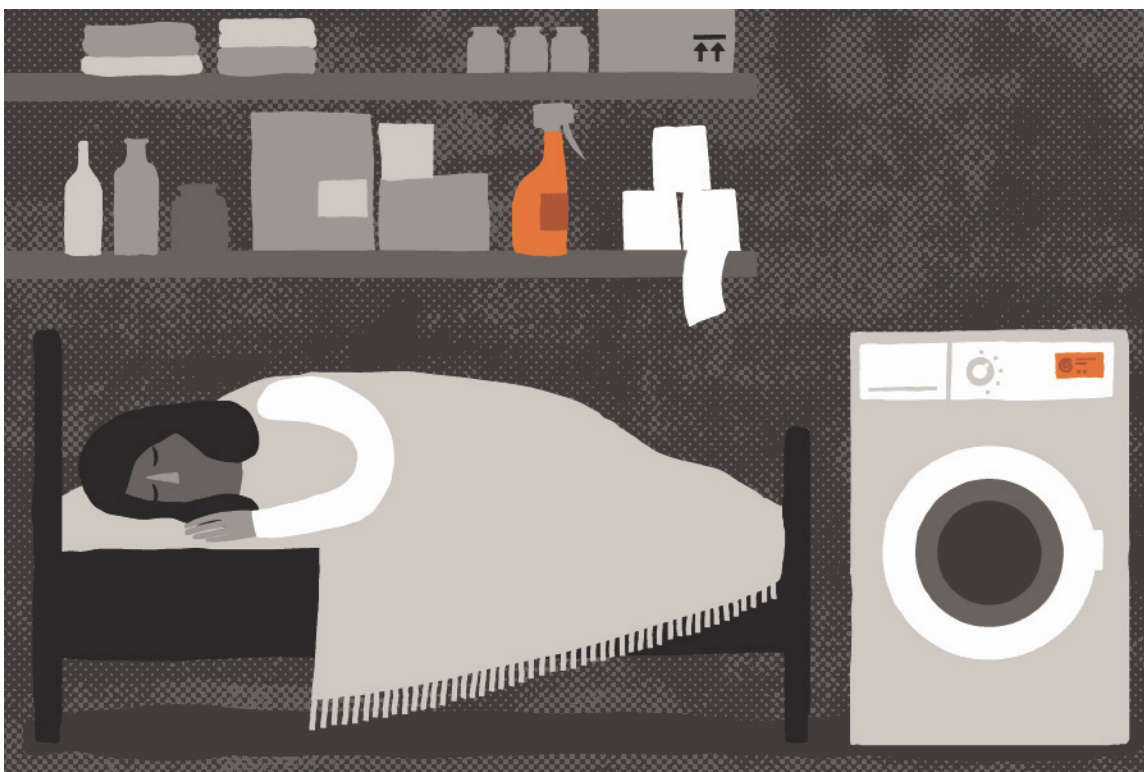
Inadequate sleeping conditions