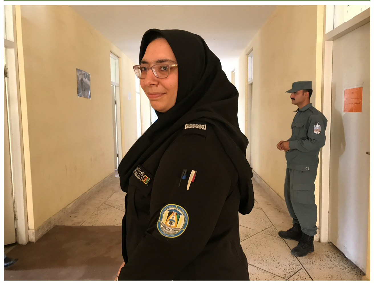
A senior policewoman in the provincial police headquarters in Herat, Afghanistan, April 2019.