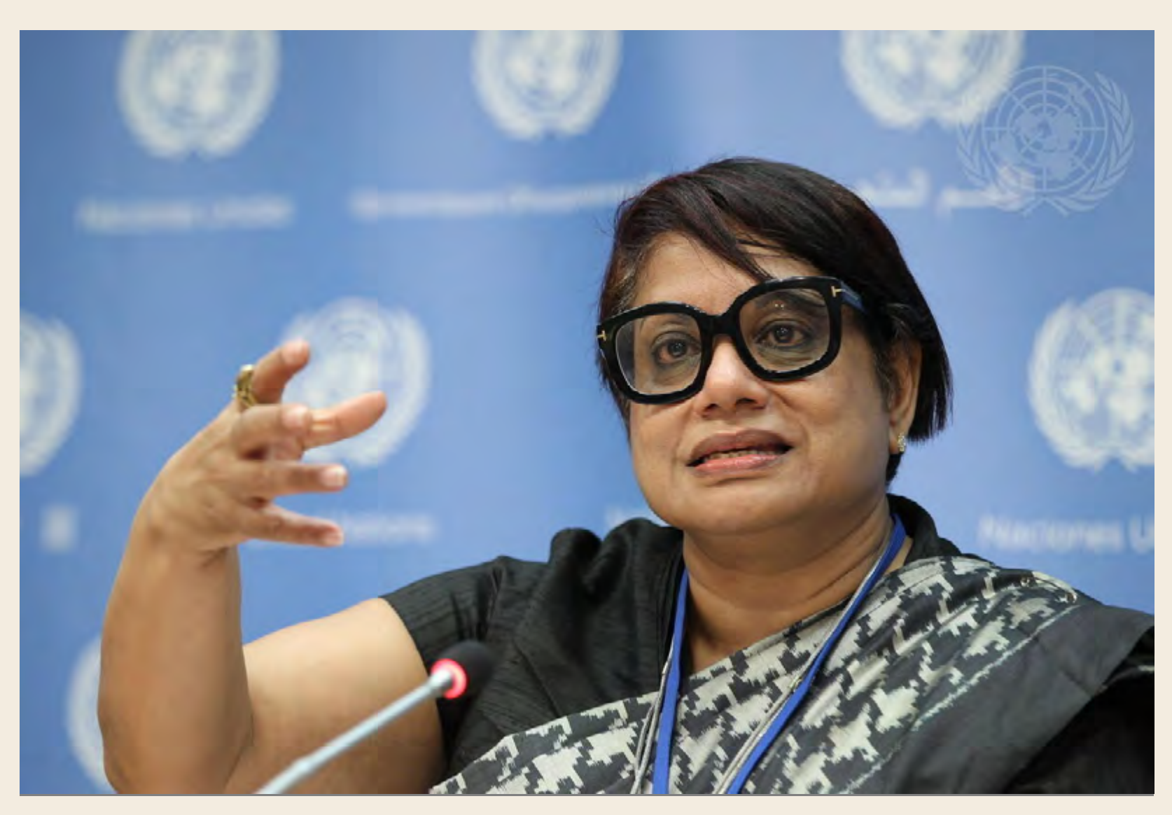
Radhika Coomaraswamy presents the Global Study on Women, Peace and Security in 2015.

When we speak about women, peace and security, we must always remember its history and inherited tradition. Resolution 1325 came after the wars in Bosnia, Rwanda: some of the worst was on record for women. The resolution came at the time when the Security Council was united.