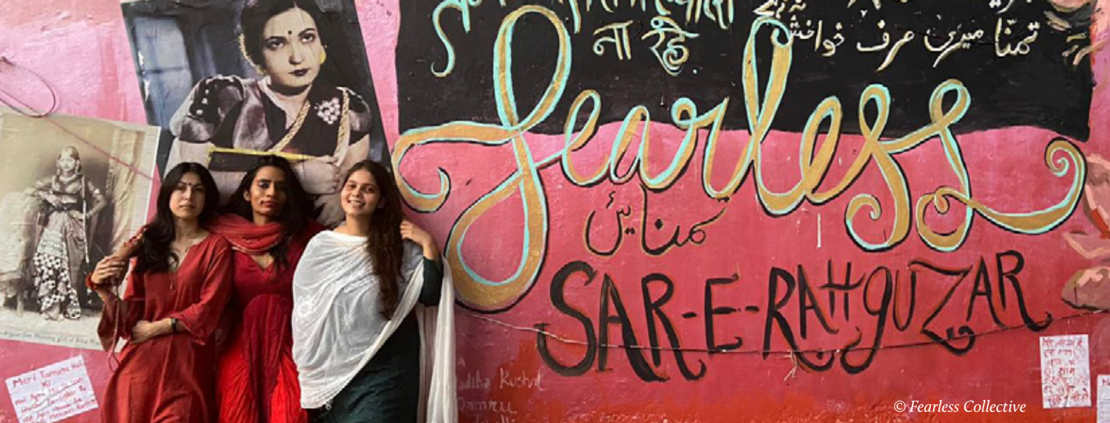
The Fearless Collective (a partner of Mama Cash in Sri Lanka) with their own mural

“The Netherlands has been a forerunner in financing women’s rights and sexual and reproductive health and rights for so long. Now I say: start working on this feminist policy with the same ambition! And not just with your policymakers in The Hague, no: make sure you develop a policy where the people you are talking about, from the South, help shape that policy. That’s where the strength lies.’ The director of CREA takes another sip and explains that she dreams of a feminist future based on the principles of justice, peace, and pacifism. That is why the new generation must take a critical look at underlying power relations—not only on the street, but also in the world.