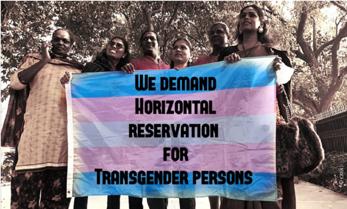
The Trans Rights Now Collective, in India

*After the far-right won the elections in October, the country dropped its policy