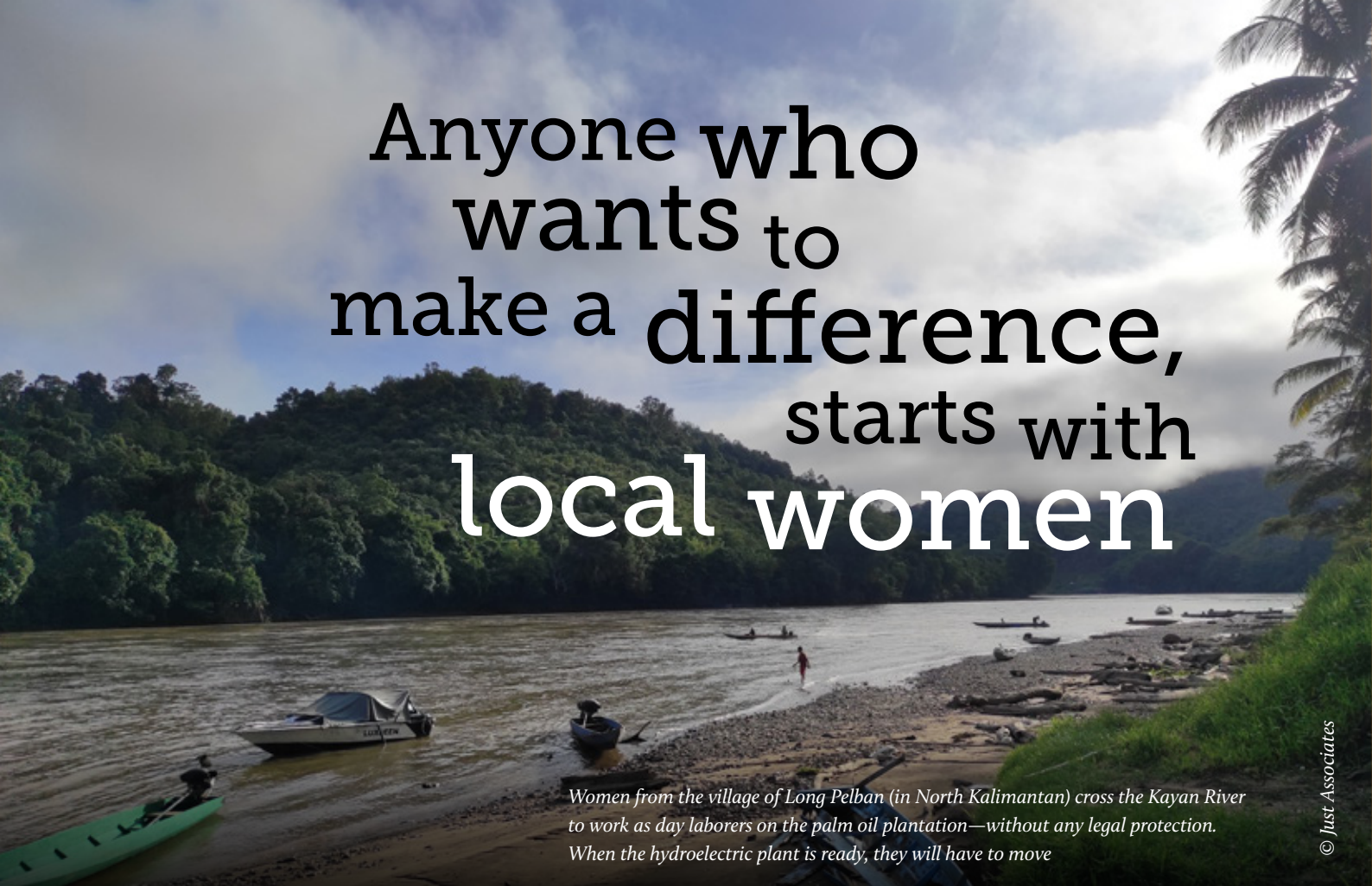
Women from the village of Long Pelban (in North Kalimantan) cross the Kayan River to work as day laborers on the palm oil plantation—without any legal protection. When the hydroelectric plant is ready, they will have to move