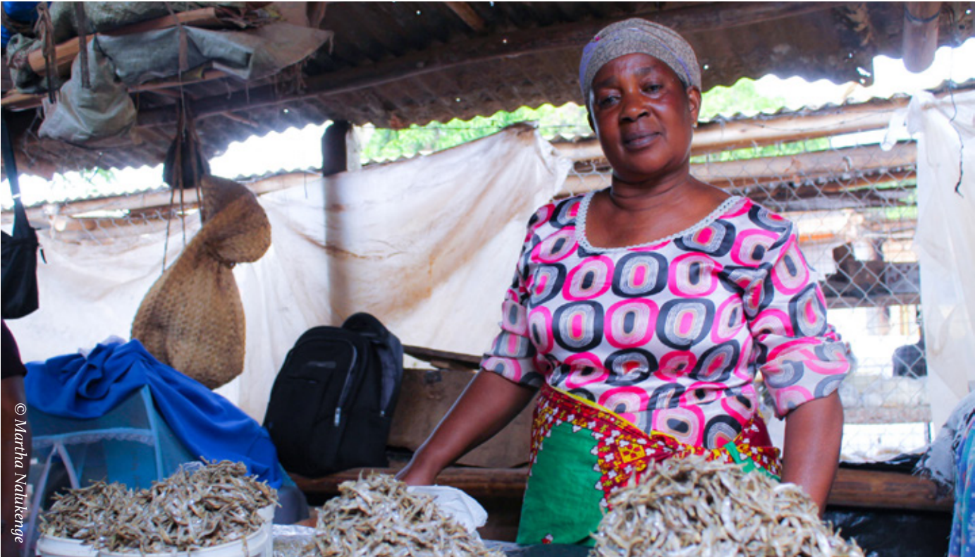
Female fish seller at the market in Masaka (Uganda)

She sits on the steering committee of the global FFP network and travels the globe to talk about it. Just last July, she spoke in America with seven governments that are interested in an FFP, including the Netherlands. She still has some advice for Wopke Hoekstra.