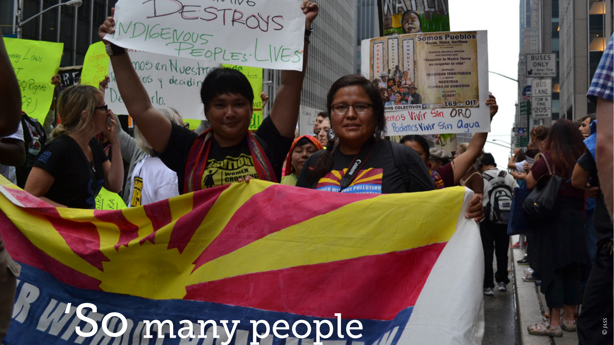
Indigenous women of the JASS movement from Central America and South East Asia, during a climate march in New York