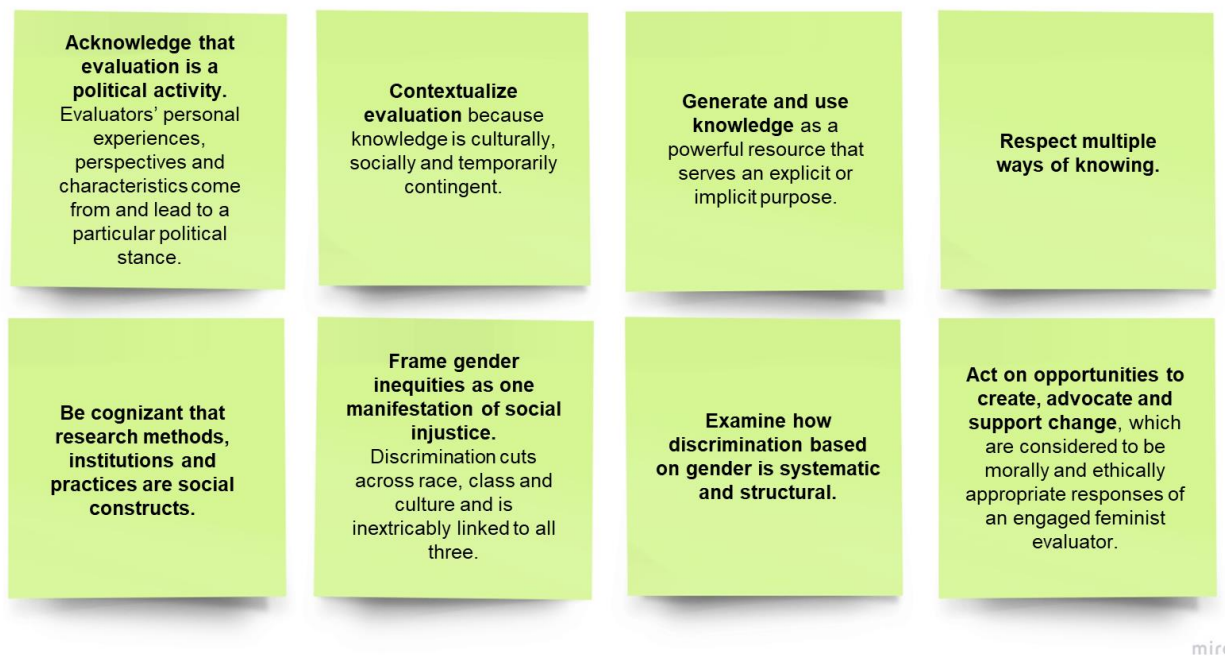
Figure 2: Applying the eight Feminist Tenets (Podems, 2020)

While the initial sampling framework included a mix of people identified by the Equality Fund and those that we identified through our own previous research, we later expanded the sample based on suggestions made by those interviewed (i.e., snowball sampling technique.) Our qualitative sampling approach (criterion sampling) used the following criteria to identify respondents: (1) people who worked explicitly as feminist MEL practitioners or organizations, and (2) those who do not identify as feminists however were known to engage in a feminist-context, women's movement, gender-lens investing, or another related field. We interviewed 38 people thorough Zoom and Google Meet.