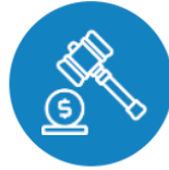
Economic justice and rights