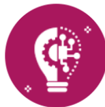
Technology and innovation for Gender Equality