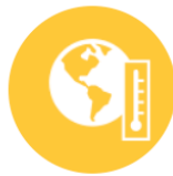
Feminist action for climate justice