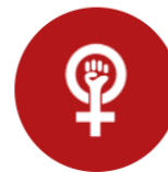
Feminist movements and leadership

Each of these Action Coalitions has developed its own priority actions for the coming years. These draft priorities are collected in the Global Acceleration Plan for Gender Equality . This feminist roadmap was presented in the Generation Equality Forum Mexico and finalized in the Paris Forum.